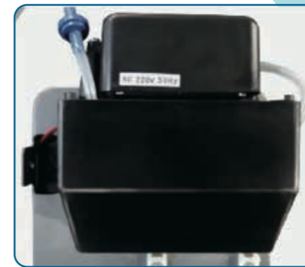
Sterilization by ozone

Impurity filtration from tap water →resin filtration →activated carbon filtration