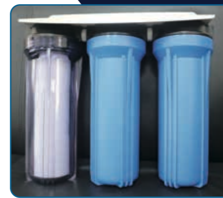
Filtration by 3 filters

* The 3D view indicates that the supply line can be as long as 20m for multiple CNC machining centers.