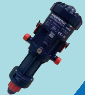
Oil-water mixer pump

The filtered tap water will be sterilized by ozone