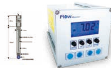
PV value detection device (optional)