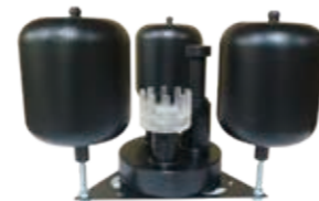
Floating oil collection seat set (optional)